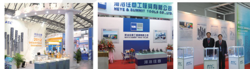
上海模具展览会 2012 DMC 2012