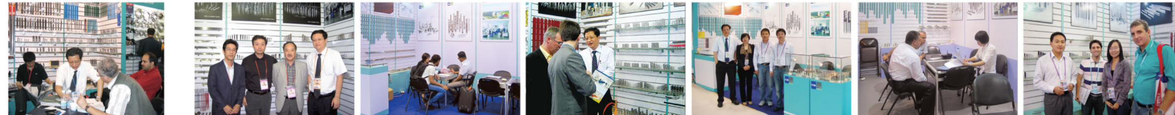
中国进出口商品交易会（广交会）97届 — 112届 China import & export fair (canton fair) 97th to 112th