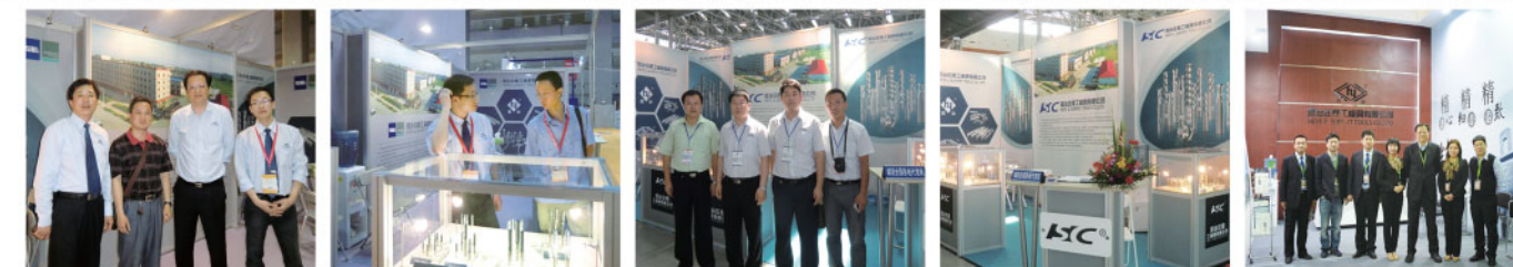
长春国际装备制造业博览会、重庆立嘉国际机床展览会、中部（长沙）制博会、沈阳国际装备制造业博览会 中国（天津）国际金属加工技术设备展览会、广州国际机床及汽车加工装备展、中国哈尔滨国际机床工模具展览会 青岛国际机床模具展览会、中国深圳国际机械制造工业展览会

河冶住商成立以来，逐步开始参加国内外有影响力的行业展览会，有效地拓展了国内外市场。 Since setting up, HSC attended the influential exhibitions home and abroad, to exploit market.