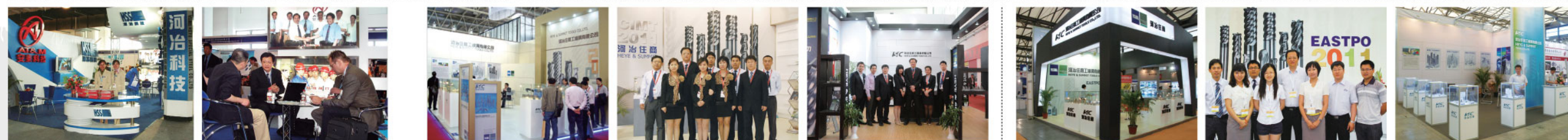
中国国际机床展览会 2005、2007、2009、2011、2013 China international machine tool show CIMT2005、CIMT2007、CIMT2009、CIMT2011、CIMT2013