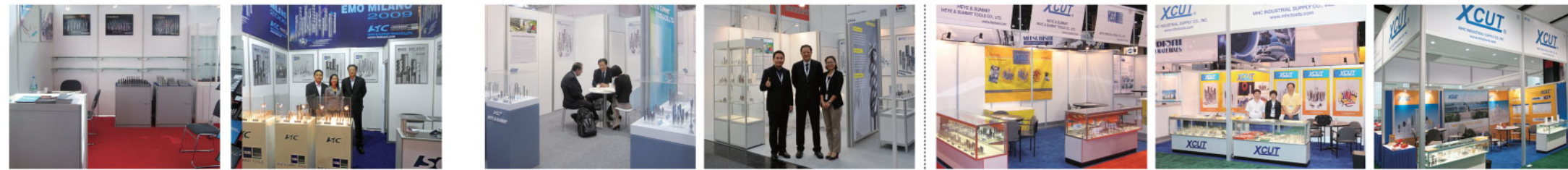
欧洲机床工具展览会 2007、2009、2011、2013 EMO 2007、2009、2011、2013 芝加哥国际制造技术展览会 2010、2012、2014 IMTS 2010、2012、2014

To fulfill the demands of “Hi-Speed, Hi-Efficiency and Top Precision” in the metal machining, HSC focused in development of cobalt HSS, PM and carbide end mills with “HSC” brand, which is widely applied into the automobile industry, aviation industry, HI-speed railway industry, marine industry, Military industry etc., and made its contribution in the process of nationalization and localization of cutting tools.